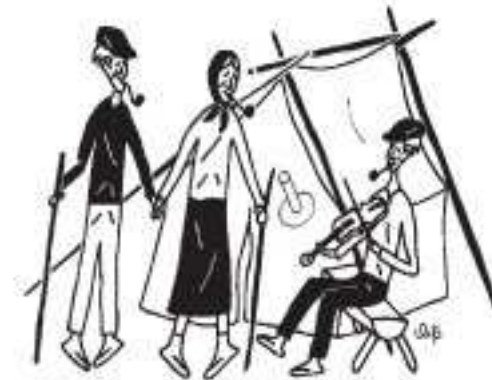
Biennial International Guich'in Gathering Old Crow, Yukon

Everyone is looking forward to local and guest musicians...get those dancing slippers ready!!